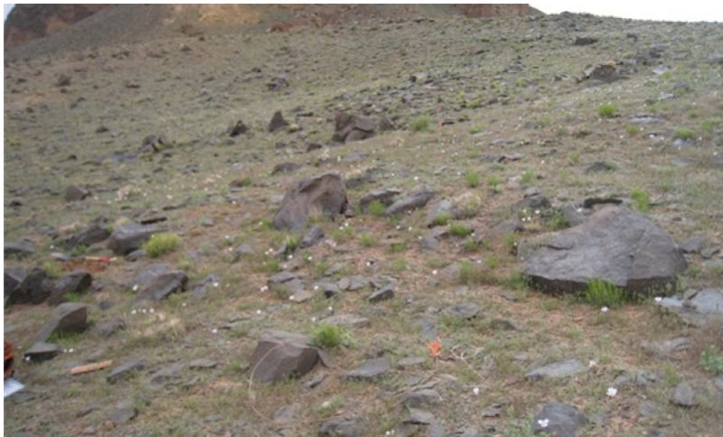
Figure 5. Cobbly Slopes 10-14" p.z. Saline

This plant community is a grassland with mid and short grasses with low growing shrubs and a relatively small percentage of forbs. Major grasses include galleta, alkali sacaton, indian ricegrass and New Mexico feathergrass. Shadscale is the major shrub. Utah juniper can occur on the site. Plant species most likely to invade or increase on this site when it deteriorates are broom snakeweed, mormon tea, sagebrush, and annuals.