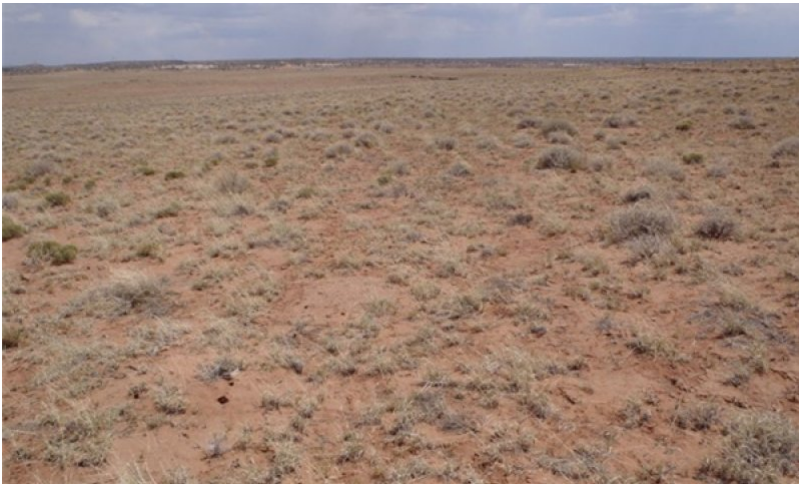
Figure 5. Sandy Loam Upland, Saline (ATCO, PLJA, ACHY)

This site has a plant community made up primarily of mid and short grasses with a relatively small percentage of forbs and shrubs. In the original plant community there is a predominance of grasses with shrubs, half shrubs. Grasses are abundant and include Indian ricegrass, galleta and alkali sacaton. Shadscale is the major shrub. Plant species most likely to invade or increase on this site when it deteriorates are broom snakeweed, rabbit brush, pricklypear cactus and annuals.