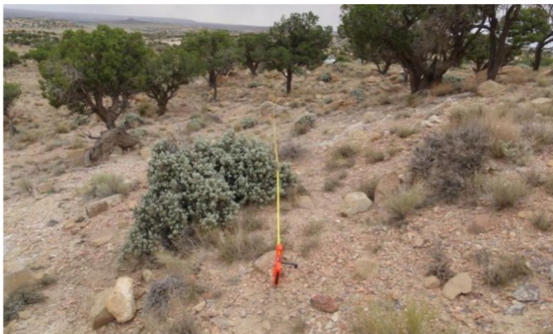
Figure 5. Cobbly Slopes 10-14"p.z.

This site is a grassland with minor amounts of shrubs and scattered trees. Major grasses include needle and thread, New Mexico feathergrass, galleta, black grama, blue grama and Indian ricegrass. Common shrubs present are Wyoming big sagebrush and broom snakeweed. Utah juniper can be present in minor amounts.