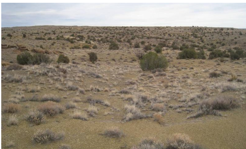
Figure 5. Shale/ Sandstone Upland 10-14" p.z. (Higher Ppt)