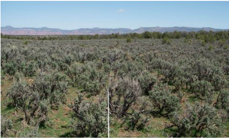
Figure 5. 35.6 Loamy Upland

The dominant aspect of the site is a grass-shrub mix. Major grasses include western wheatgrass, blue grama and bottlebrush squirreltail. Dominant shrubs are mountain and Wyoming big sagebrush.