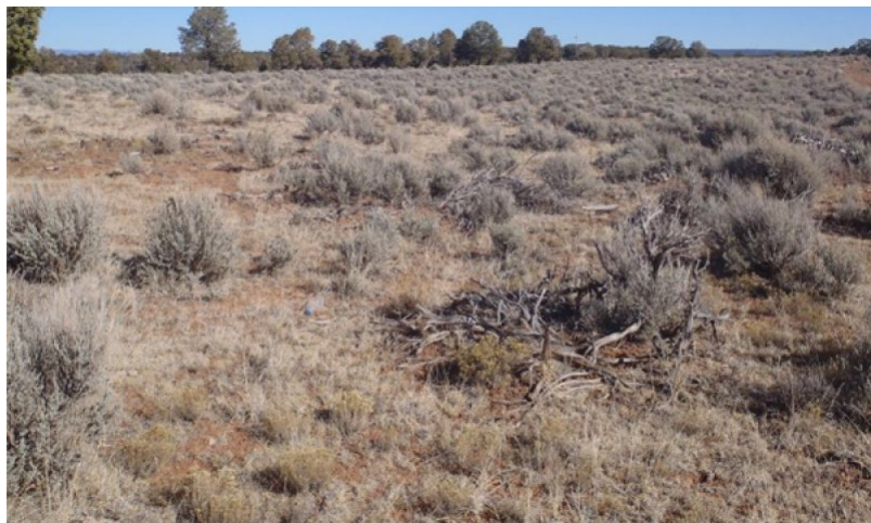
Figure 5. Sandy Loam Upland 13-17"p.z.

1.1 Grassland - Shrub Community: Major grasses are needle and thread, blue grama and squirreltail. Major shrubs include winterfat, fourwing saltbush and Wyoming big sagebrush. Grasses are 50-60% of the plant community composition and shrubs are 30-40%. A few forbs are present along with an occasional tree.