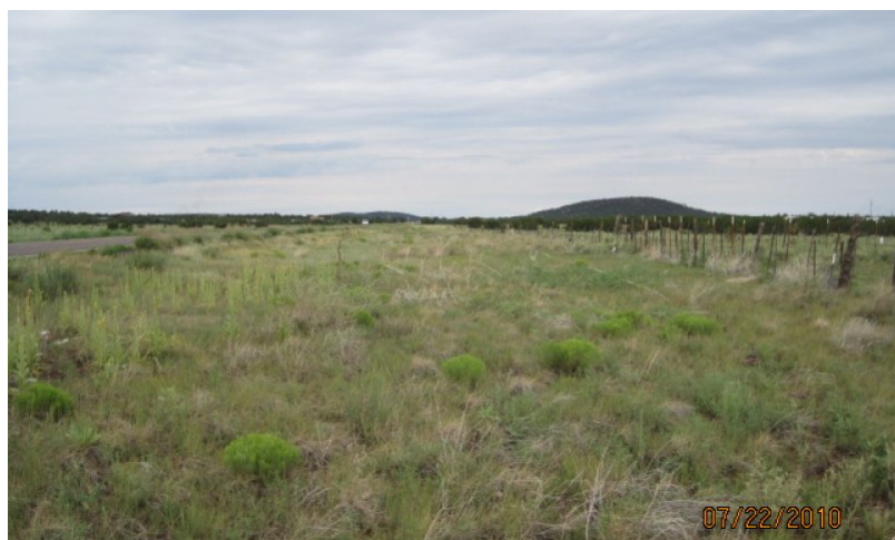
Figure 5. Clayey Upland 14 to 18" p.z. AZ Highway 60 about 3

This site has a plant community made up primarily of rhizomatous cool season grasses, warm season sod and bunch grasses, cool season bunch grasses, annual and perennial forbs and a small percentage of shrubs and trees. Plant species that may invade or increase when this site deteriorates are broom snakeweed, wooly groundsel, cacti and exotic annual grasses and forbs. Without periodic natural fire, trees will also increase in the plant community.