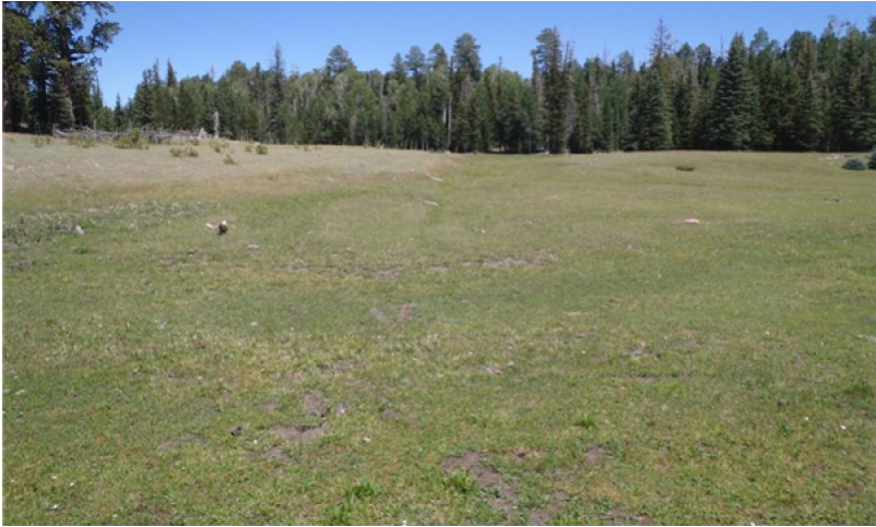
Figure 5. 35.8 Loamy Upland 17-25"p.z. R035XH807AZ - Grazed

1.1 This community is dominated by cool season grasses and a variety of forbs are present.