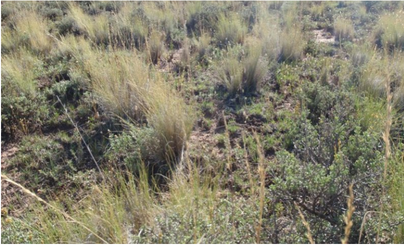
Figure 5. Relict area of the HCPC plant community

Site is a grass-shrub plant community. There are various areas with an occasional Gambel oak, common chokecherry or ponderosa pine. In addition, Utah serviceberry and mountain snowberry may be present. Black sagebrush is the major shrub. Grasses include muttongrass, western wheatgrass, Arizona fescue and bottlebrush squirreltail. With severe disturbance, black sagebrush and trailing fleabane will increase; cheatgrass and annual forbs will invade.