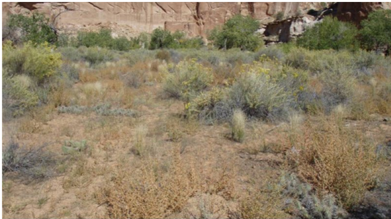
R035XY015UT—Sandy Bottom (Fourwing Saltbush) community 2.3—Fourwing Saltbush/Reduced Perennial