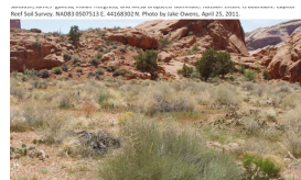
Fourwing Saltbush/Perennial Grass