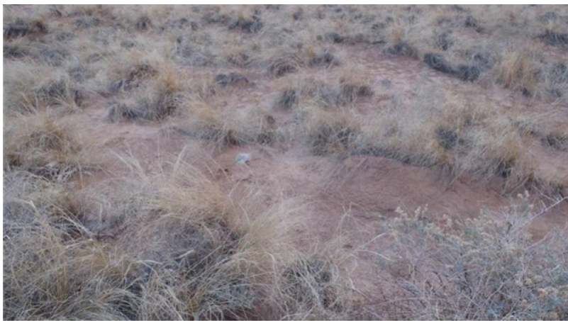
R035XY015UT—Sandy Bottom (Fourwing Saltbush) community. Perennial grass. Cover is 32% grass, 2% forb,