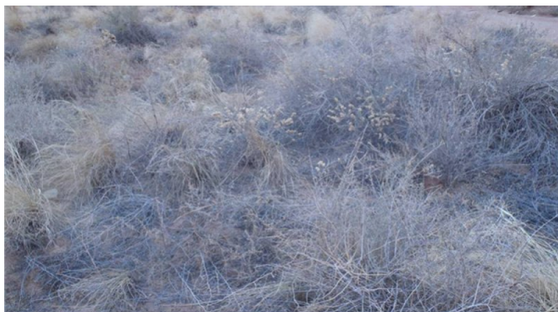
R035XY015UT—Sandy Bottom (Fourwing Saltbush) community 1.1—Fourwing Saltbush/Perennial grass.