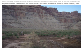
Fourwing Saltbush/Annual Grass Understory

This pathway occurs when above average spring precipitation and below average summer precipitation favors cheatgrass over annual forbs.