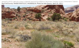
Fourwing Saltbush/Perennial Grass

This pathway is the natural increase in fourwing saltbush until the shrub again co-dominates the site. It occurs when fourwing saltbush is not subjected to persistent heavy browse, insect herbivory, or inundation for many years.