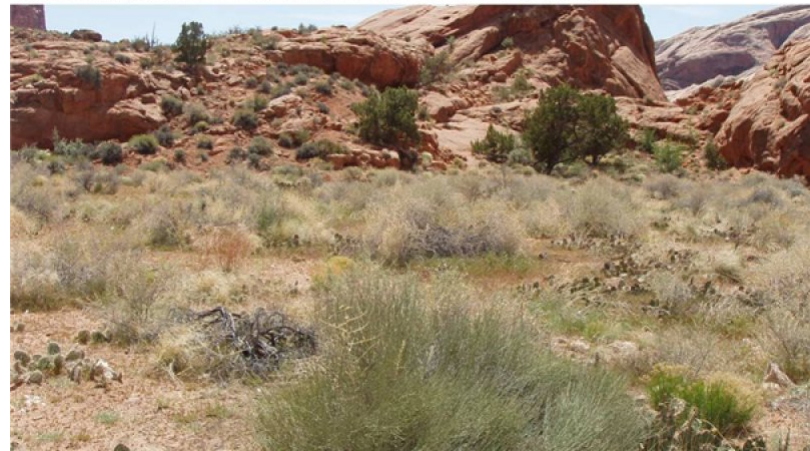
Figure 9. Phase 2.1

Phase 2.1 is similar to the reference plant community in composition and ecological function, but it allows for the presence of non-native/invasive species. It is dominated by fourwing saltbush and perennial grasses. Percent composition by air-dry weight is 35-60% perennial grasses, 5-15% forbs, and 35-60% shrubs.