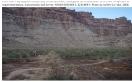
Fourwing Saltbush/Annual Grass Understory