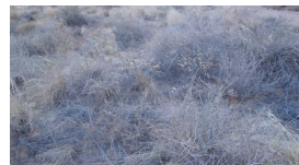
Fourwing Saltbush/Perennial Grass