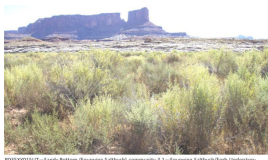
Fourwing Saltbush/Forb Understory