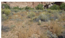
Fourwing Saltbush/Reduced Perennial Grasses

This pathway occurs when perennial grasses are reduced in the understory due to excessive grazing during the growing period. Perennial grasses are losing their ability to propagate themselves, and non-native species may co-dominate the understory.