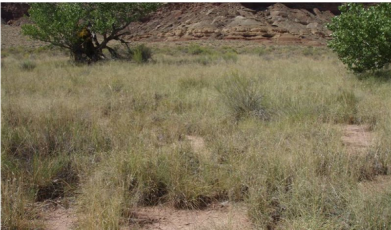
Figure 11. Phase 2.2

This plant community is similar to phase 1.2 in structure and function, but it allows for non-native/invasive species to be present. Deep-rooted perennial bunchgrasses dominate the site. Fourwing saltbush is not dominant due to persistent heavy browsing over many years, insect herbivory, or prolonged anaerobic soil conditions (flooding). Percent composition by air-dry weight is 65-95% perennial grasses, 5-10% forbs, and 0-30% shrubs.