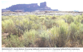
Fourwing Saltbush/Forb Understory

This pathway may occur in years with low spring moisture and high summer precipitation.