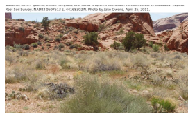
Fourwing Saltbush/Perennial Grass