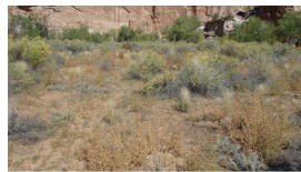
Fourwing Saltbush/Reduced Perennial Grasses