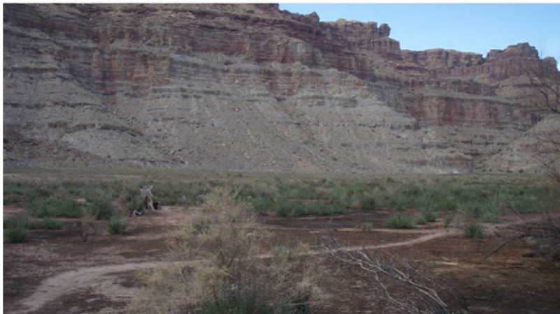
Figure 16. Phase 3.2

Recent spring rainfall and possibly increased cheatgrass dominance prior to fire and is expected to regain dominance. Canyonlands Soil Survey. NAD83 0593489 E. 4223893 N.