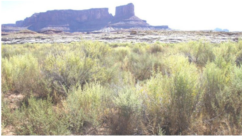
R035XY015UT—Sandy Bottom (Fourwing Saltbush) community 3.1—Fourwing Saltbush/Forb Understory.