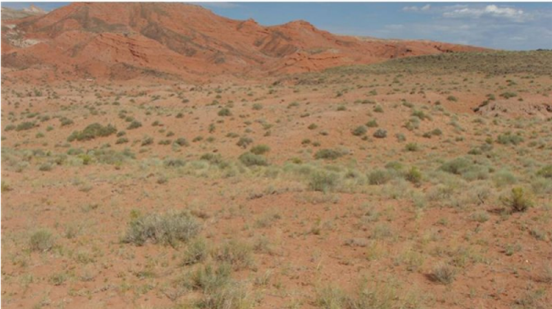
Figure 4. Phase 1.1

dominant, medium height, green herbaceous, and many taproot and common, lighter root, semi-erect, taxadjunct soil component. NAD83 0487313 E. 4238223 N. Photo by Jake Owens, June 30, 2010.