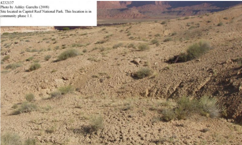
Figure 5. 1

This plant community phase is dominated by Torrey’s jointfir, shadscale, and perennial grasses. Grasses may include but are not limited to, Indian ricegrass, galleta, and sand dropseed. Galleta is typically the dominant perennial grass species in this plant community phase. Other perennial grasses may or may not be present. Other perennial shrubs, and forbs may be present and cover is variable. Bare ground is 0-8% and biological crusts are 0-50%. Surface rock fragments (0-60%) can be very prevalent and are characterized by gravels.