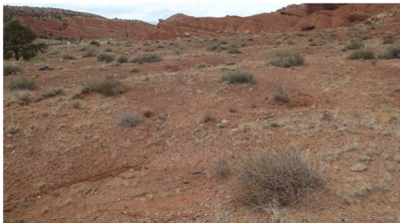
Figure 5. Phase 1.1

Shadscale and Torrey's jointfir are common. Sagebrush and grasses are also common. Photo by Jamin Johanson, April 20, 2011.