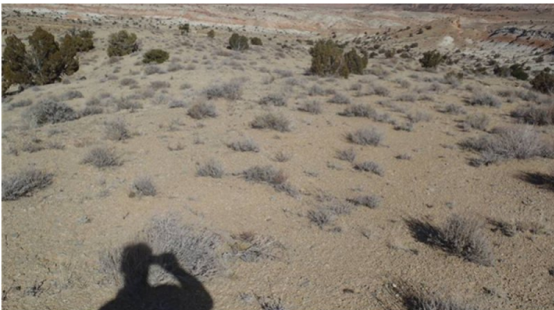
Semidesert Shallow Loam (Torrey's jointfir) community 1.1—Reference Plant Community. Cover is 2% grass,