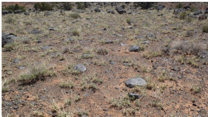
R035XY242UT—Semidesert Gravelly Loam (Shadscale). Community Phase 1.1—Shadscale and Galleta