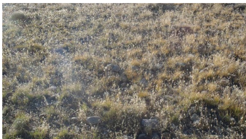
R035XY242UT—Semidesert Gravelly Loam (Shadscale). Community Phase 2.1—Invaded Shadscale and Galleta