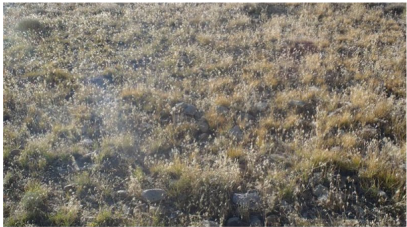
R035XY242UT—Semidesert Gravelly Loam (Shadscale). Community Phase 2.1—Invaded Shadscale and