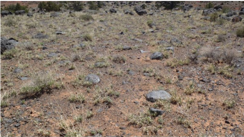
R035XY242UT—Semidesert Gravelly Loam (Shadscale). Community Phase 1.1—Shadscale and Galleta

The reference state is highly resistant to change due to the general lack of fire or other natural disturbances, and a harsh soil environment that does not support many invasive species. The fuel loads are too sparse to carry a fire under normal weather conditions, and insect or disease impacts have not been documented to have a major impact on the plant community of the site. The resulting condition is a reference state that perpetuates itself on the site indefinitely under natural historical conditions. Soil surface disturbance from recreation, livestock, or natural means may increase the likelihood that cheatgrass, Russian thistle, or halogeton establishment on this site. These invasive species may establish in the absence of any major disturbance, but they are not known to dominate this site at the present time.