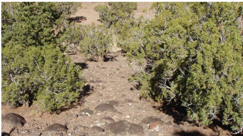
R035XY246UT—Semidesert Stony Loam (Utah Juniper-Pinyon) community 2.1—Utah Juniper-Pinyon