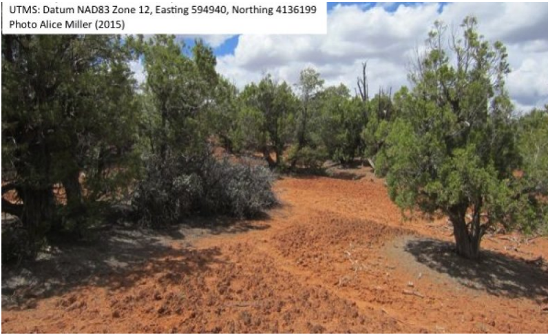
Figure 9. Community Phase 2.1