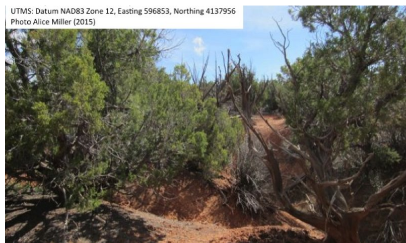
Figure 8. Community Phase 2.1