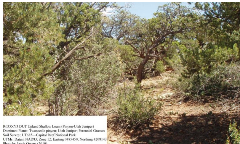
Figure 4. Reference State

This community phase is characterized by a twoneedle pinyon and Utah juniper upper canopy. In the lower canopy, commonly seen grasses include Indian ricegrass and galleta. Other perennial grasses, shrubs, and forbs may or may not be present and cover is variable. Bare ground is variable (6-16%) depending on surface rock cover, which is also variable (8-54%). The composition by air dry weight is approximately 20% perennial grasses, 10% forbs, 45% shrubs, and 25% trees. In average years, plants begin growth around March 10 and end growth around October 10.