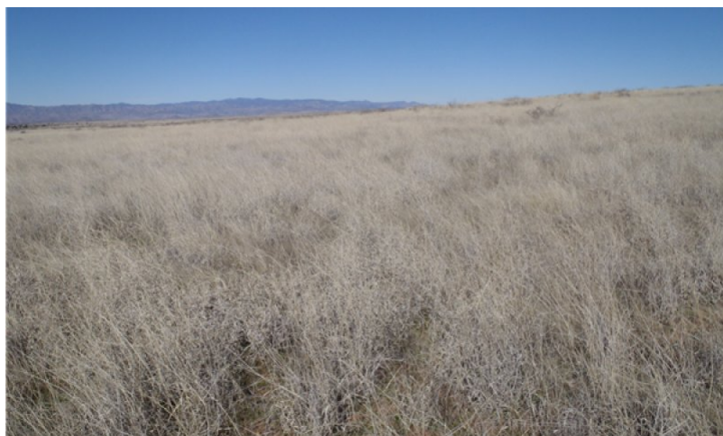
Figure 8. Tobosa grassland

The historic, native, plant community is a grassland dominated by tobosa grass with lesser amounts of vine mesquite and bottlebrush squirreltail. A rich flora of native annual forbs and grasses, of both the winter and summer