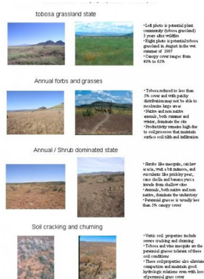
Figure 7. Clayey Upland 12-16" p.z. photos