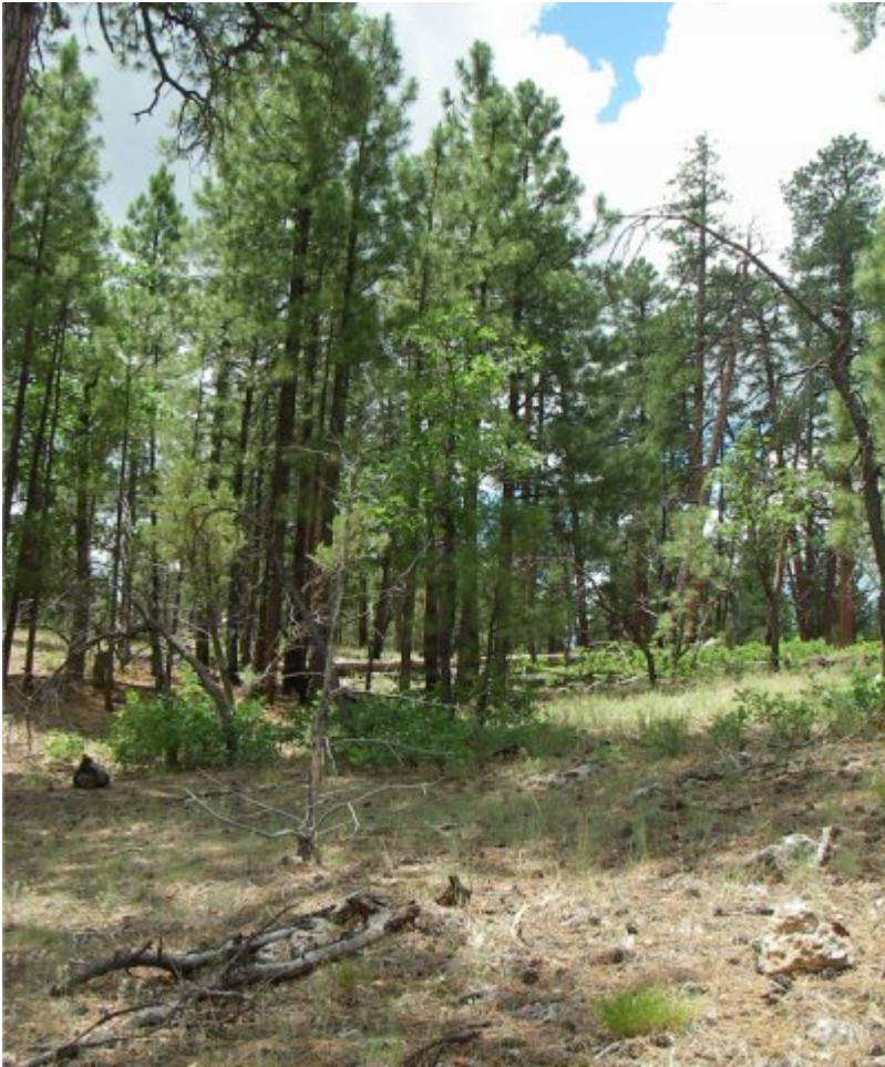
Table 5. Annual production by plant type