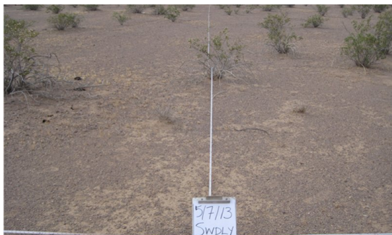
Figure 9. Limy Fan, 7-10" p.z., Creosote Community