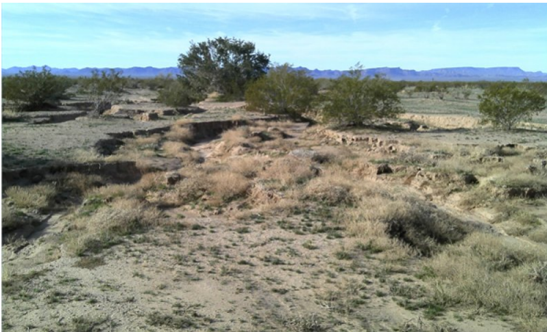
Figure 10. Limy Fan, 7-10" p.z., Eroded