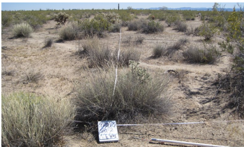
Figure 7. Limy Fan, 7-10" p.z., Reference Community

The potential plant community is a mixture of desert shrubs and sub-shrubs with cacti, perennial grasses and annuals well represented throughout. Creosote dominates with a wide range of other shrubs present, such as wolfberry, palo verde, graythorn, or ironwood, sparsely present. Sub-shrubs, an even mix of bursage and ratany,