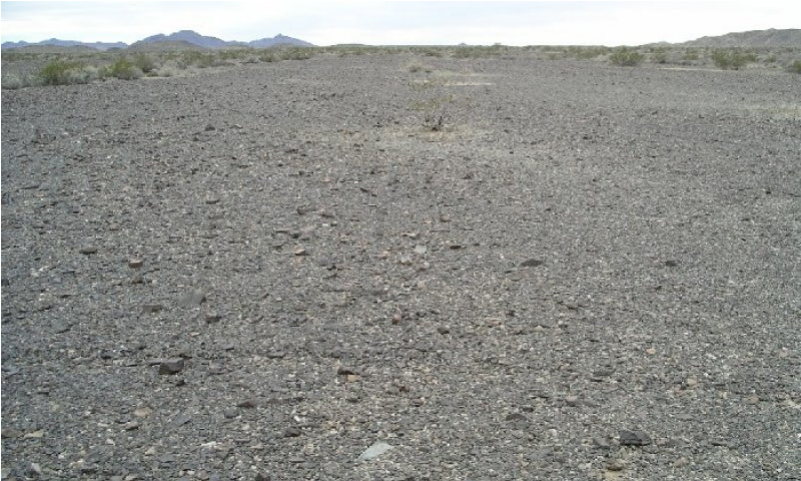
Figure 3. Desert Pavement