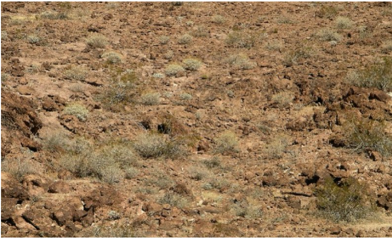
Figure 3. Reference Community