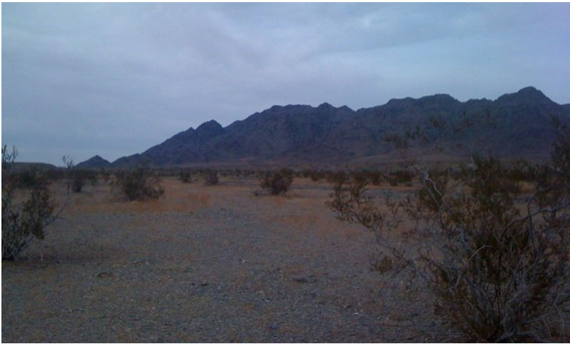
Figure 3. Community Phase 2.1