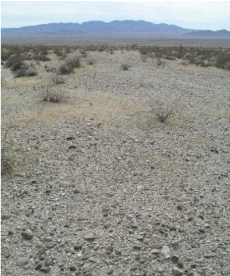
Figure 4. Community Phase 2.1

The reference plant community is dominated almost entirely by creosote bush. White ratany, burrobush, and big galleta may be present as very minor species. Annual forbs may contribute 20 to 40 percent of annual production during year of average to above average precipitation. Common species include desert Indianwheat ( Plantago ovata ), pincushion flower ( Chaenactis fremontii ), and cryptantha species (Cryptantha). This site can sometimes appear like a young desert patina, which is what it may become if the site continues to remain stable for many years.