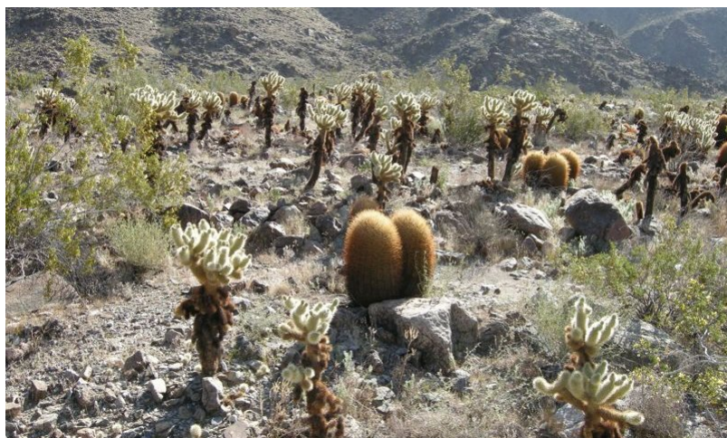
Figure 5. Community Phase 2.1

The reference plant community of this ecological site is characterized by dense teddybear cholla colonies, and brittlebush and creosote bush are the dominant species by production. This site has relatively high shrub cover and diversity. California barrel cactus and ocotillo may be relatively abundant. Other shrubs and subshrubs include desert lavender ( Hyptis emoryi ), California fagonbush ( Fagonia laevis ), sweetbush ( Bebbia juncea ), narrowleaf silverbush ( Argythamnia lanceolata ), and burrobrush ( Hymenoclea salsola ). Native annual forbs and grasses may be seasonally abundant, and common species include brittle spineflower ( Chorizanthe brevicornu ), pincushion flower ( Chaenactis fremontii ), distant phacelia ( Phacelia distans ), chia ( Salvia columbariae ), and sixweeks threeawn ( Aristida adscensionis ). The leguminous trees desert ironwood ( Olneya tesota ) and blue paloverde ( Parkinsonia florida ) may be sparsely distributed across the site. The non-native annual grass Mediterranean grass may be sparsely present.