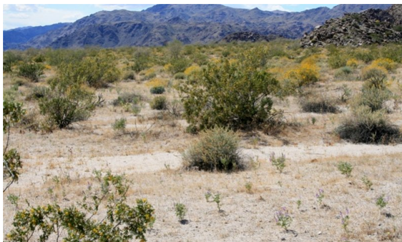
Figure 5. Reference Community

This community phase is dominated by creosote bush and brittlebush. Secondary shrubs are present at low levels, and include burrobush, burrobush ( Hymenoclea salsola ), Schott's dahlia, branched pencil cholla ( Cylindropuntia ramosissima ), and ocotillo ( Fouquieria splendens ). Desert ironwood ( Olneya tesota ) and blue paloverde ( Parkinsonia florida ) are generally trace species. Forbs are present in most years, with higher production and diversity during years of higher precipitation. Common species include pincushion flower ( Chaenactis fremontii ), cryptantha ( Cryptantha spp.), buckwheat ( Eriogonum spp.), smooth desertdandelion ( Malacothrix glabrata ), desert poppy ( Eschscholzia glyptosperma ), pygmy poppy ( Eschscholzia minutiflora ), lupine ( Lupinus sp.), birdcage evening primrose ( Oenothera deltoids ), desert Indianwheat ( Plantago ovata ), and chia ( Salvia columbariae ). The non-native annual forb red-stem stork's bill ( Erodium cicutarium ) is present with up to 6 percent cover, and Asian mustard ( Brassica tournefortii ) is occasionally present with less than 1 percent cover. The non-native Mediterranean grass ( Schismus sp) is often present with low cover.