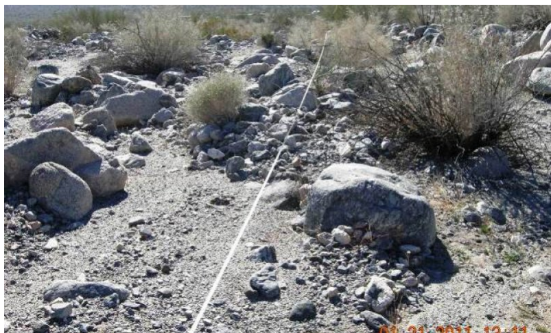
Figure 7. Blue paloverde- Schotts dalea