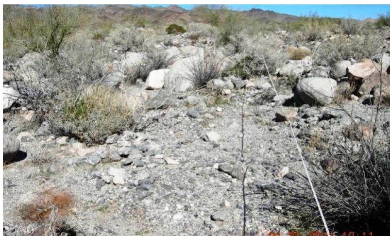
Figure 8. Blue paloverde- Schotts dalea