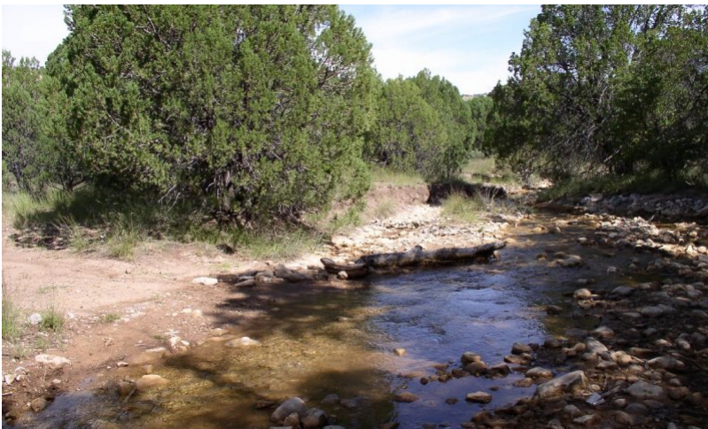
Figure 11. Sandy Wash, QUAR, QUEM 16-20" pz. juniper

This state occurs where mesquite and / or juniper species invade and increase in the absence of fire for long periods of time. These species can dominate the openings in the tree canopy with cover ranging from 5 to 30%. Fires can still burn after wet summers but these shrubs are well established and will sprout and quickly dominate the openings again.