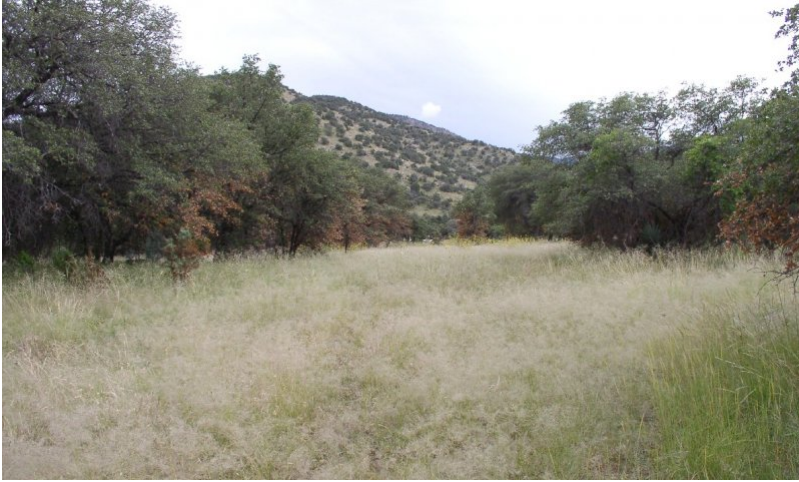
Figure 10. Sandy Wash, QUAR, QUEM 16-20" pz. Lehmann

This state occurs where exotic grasses like Lehmann, Boer, weeping lovegrass, bermuda, Johnson grass, and / or yellow bluestem has invaded from adjacent or up-stream areas with a seed source. As the non-native grasses increase to dominate the under-story, native perennial grasses and forbs are reduced to minor amounts. Fires will act to increase the dominance of Lehmann lovegrass in the under-story.