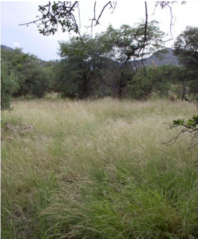
Figure 7. Sandy Wash QUAR, QUEM 16-20" pz. HCPC

This site has a mixed plant community with an over-story canopy of Arizona white oak and Emory oak, and lesser amounts of walnut, ash, desert willow and other trees. The under-story is dominated by perennial grasses and forbs. Evergreen live-oaks change their leaves in April and May. The aspect is evergreen woodland. Channel and stream bank erosion and sedimentation are natural features of this site. Stream flow is intermittent and surface flow occurs sporadically during the winter months only. Springtime stream flow is not sufficient enough for the broadleaf deciduous riparian species. Oak species present on the site reproduce from acorns which germinate in the summer immediately after being produced. These species also sprout after cutting, flood injury, or fire. Tree canopy ranges from 20 -50%. Number of stems ranges from 200-400 per acre. Under-story composition and production varies with percent canopy cover. Trees reach maximum size on this site. Disturbance of the dominant native tree cover on the site can lead to increases of species such as mesquite and juniper. Disturbance of the under-story can lead to increases in species like southwestern rabbitbrush and wait-a-bit mimosa. Management of the under-story should be aimed at leaving enough cover to protect the soils from erosion and to trap sediment in the summer flooding season.