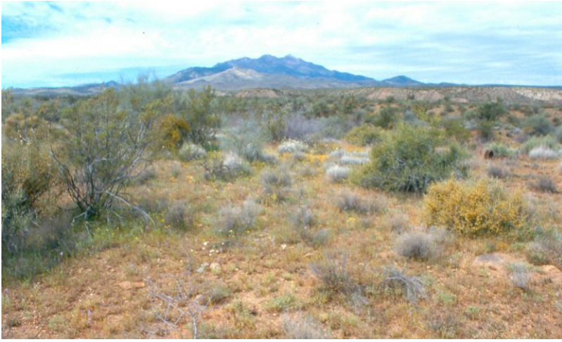
Figure 5. Clayloam Upland 8-12" pz.

The native potential plant community on this site is a mixture of perennial grasses and desert shrubs and cacti. Annual forbs and grasses, of both the winter and summer seasons, are very important in the plant community in their respective (wet) seasons. Tobosa is the dominant perennial grass, with lesser amounts of gramas and threeawns. The cover of some shallow rooted grass species, like curley mesquite, fluctuate widely from wet to dry years.