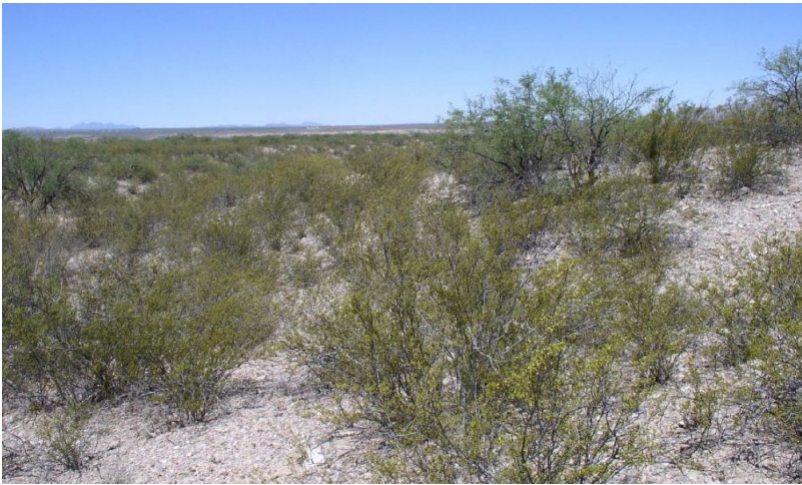
Figure 5. Limy Slopes 8-12" pz.

This plant community is dominated by creosote bush and whitethorn acacia. Annual grasses and forbs are an important part of the plant community in wet seasons. Perennial grasses are important only on north aspects. Cryptogams are common on this site, often colonizing areas with low covers of gravel and rock.