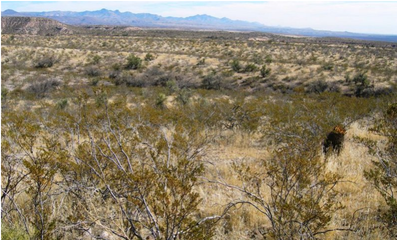
Figure 7. Limy Slopes 8-12" pz., red brome

This plant community occurs where the native shrub cover is still dominant but the herbaceous layer of the plant community is dominated by non-native annual forbs and grasses. These species can include filaree, mediterranean grass, red brome, Sahara mustard, malta starthistle and London rocket.