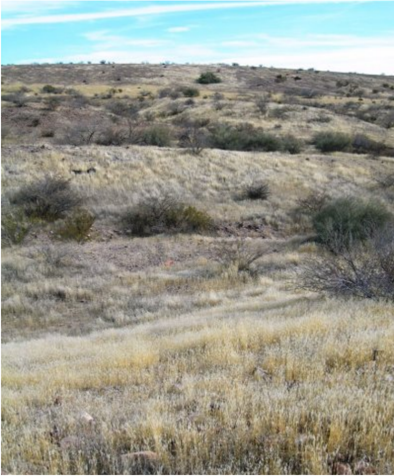
Figure 8. Limy Slopes 8-12" pz. two fires since 1983.

This state occurs where areas of the site are subject to repeated fires. This state is usually adjacent to residential areas or along heavily travelled roads where the incidence of fires is high. Repeated burning removes native shrubs and leaves a plant community dominated by native and non-native annual forbs and grasses.