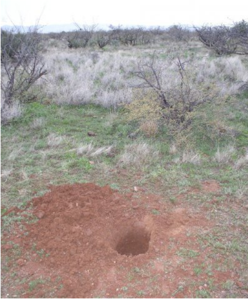
Figure 6. Clayloam Upland 12-16" pz. mesquite, tobosa

Mesquite increases in the absence of fire for long periods of time. Native perennial grasses maintain dominance with good grazing management, and with mesquite canopy levels from 2 to 10%. Tobosa, curly mesquite and blue grama are dominant and the site remains stable as long as basal cover does not drop below 7 or 8%. Snakeweed and burroweed cycle with climate but never gain dominance. Lehmann lovegrass can invade the site in this state, but is not well adapted to the heavy soil textures and will not dominate the under-story. It will seldom exceed 5 to 15% canopy levels and will die during severe drought on this site. Some soil compaction has occurred due to livestock traffic, but hydrologic processes are not impaired.