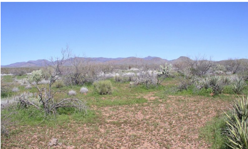
Figure 7. Clayloam Upland 12-16" pz. mesquite, shrubs, annua