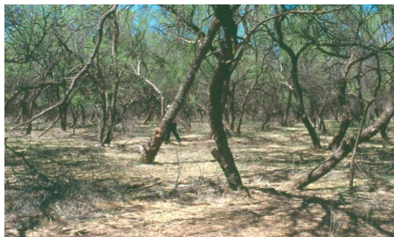
Figure 4. Loamy Bottom, PROSOP 12-16" pz. HCPC