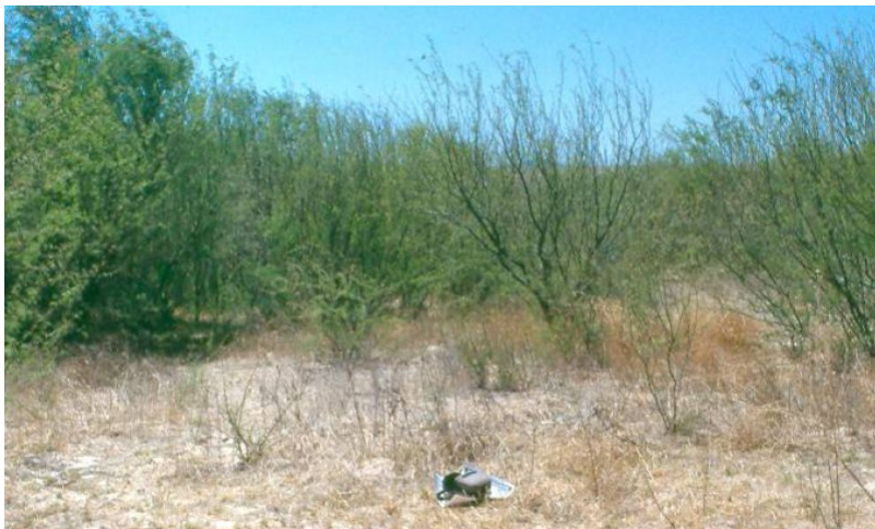
Figure 6. Loamy Bottom, PROSOP 12-16" pz. thornscrub

This state occurs where mesquite has been cleared for cultivation and subsequently abandoned; or where mesquite has been cut for fuel-wood. The water table is intact. Mesquite re-growth and / or sprouts form a thorn-scrub with a 25-50% canopy 15 years after wood harvest or clearing that leaves root systems alive. Mesquite will take much longer to re-colonize areas that have been cleared and cultivated. Mesquite seeds need to be introduced to these areas and new plants will take 15 to 20 years for roots to reach the water table. It will take from 50 to 100 years with no further mesquite harvest for trees to reach maturity on the site.