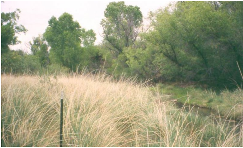
Figure 5. Sandy Bottom, subirrigated POFR, 12-16" pz.

This site has a mixed plant community with an over-story of cottonwood and willow and an under-story of tree seedlings, perennial and annual grasses and forbs, and some shrubs. Both cottonwood and willow flower in spring and leaf out shortly after. Both lose their leaves in the fall with first frost. The aspect is deciduous riparian woodland. Channel and stream-bank erosion and sedimentation are natural features of this site. Tree species present are vigorous root and stem sprouters after cutting or injury from floods. Establishment of the major species from seed can only occur with sedimentation. Both cottonwood and willow seedlings pioneer sandbars and beds of coarse textured alluvium left after large floods. Under-story production varies greatly with different percent of canopy cover. Canopy cover ranges from 60-80%. Trees reach maximum size on the site. Excessive ground water pumping can, over time, lower water tables beyond the loss of tree roots and cause excessive loss of trees. Natural fire may have been important in maintaining herbaceous under-stories. Salt cedar can invade and become dominant with destruction of the native tree cover. Bermuda and Johnson grasses are introduced species commonly found on this site.