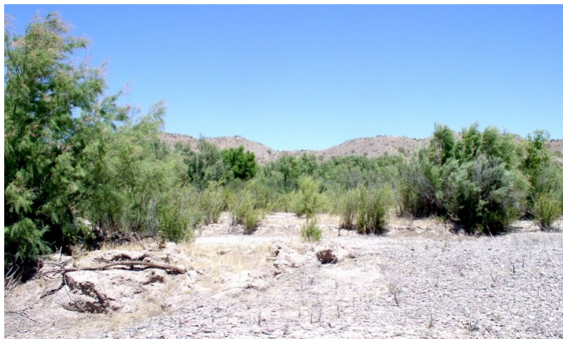
Figure 9. Sandy Bottom, subirrigated POFR, salt cedar

This state occurs where salt cedar has invaded the plant community. As mature native trees are lost to old age, fire and / or flooding, salt cedar increases to dominate the plant community. As salt cedar canopies approach 70-80% the under-story is reduced to zero. Salt cedar concentrates salts in it's leaves, which return to the soil surface in litter-fall and increase surface salinity.