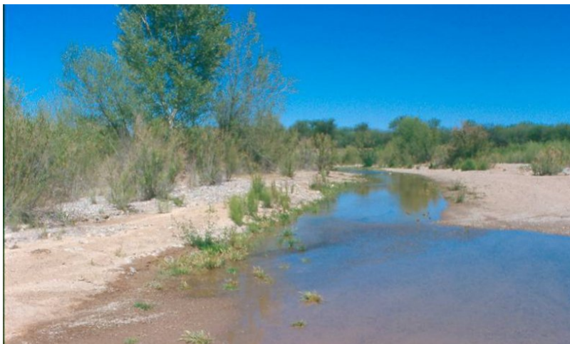
Figure 7. Sandy Bottom, subirrigated POFR, strand vegetation

This site occurs where continuous grazing has greatly reduced the reproduction of cottonwood and willow. Seedlings of cottonwood and willow species are relished by livestock. As mature trees are lost to old age, fire or flooding, the plant community is reduced to a shrubby strand along the stream-banks with a variety of native and non-native grasses and forbs on the stream terraces. Seep willow, burrobrush and other shrubs line the banks along with occasional saplings of cottonwood and / or willow. Introduced grasses like bermuda grass, yellow nutsedge and Johnson grass are common on the floodplain. Non-native annuals grasses like rabbitfoot grass, annual bristlegrass, barnyard grass, stinkgrass and junglerice are common in this state. Introduced forbs include horehound, dandelion, horseweed, hoary cress, sow thistle, prickly lettuce and plantain.