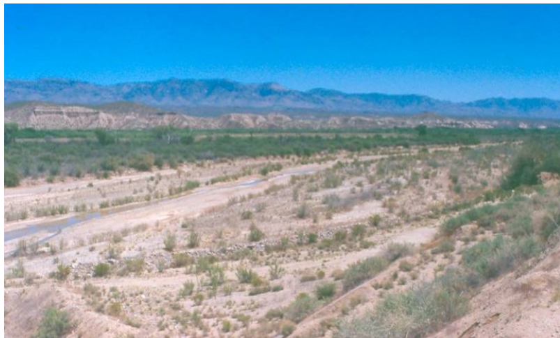
Figure 8. Sandy Bottom, subirrigated POFR, riverwash

This state occurs where groundwater pumping has dropped the water-table below the roots of the riparian tree species and stream-flow has been greatly reduced to flash floods following large storms. Stream-banks are largely unprotected. Channel areas widen, deepen and are colonized in places by shrubs like burrobrush, seep willow, mesquite and desert broom. Floodplain areas are lost to stream-bank erosion.