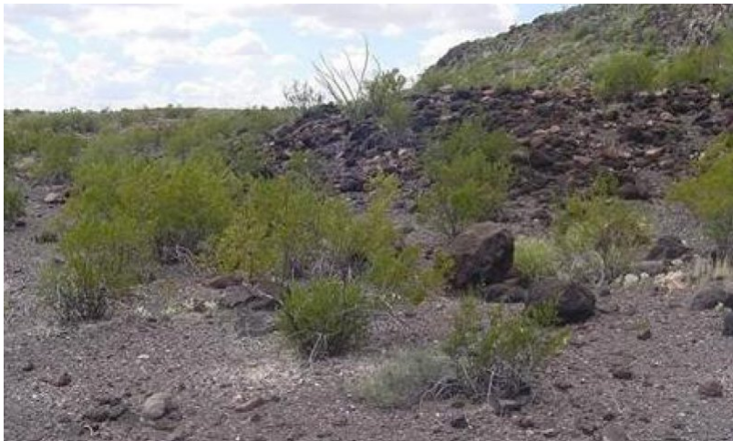
Figure 11. 2.1 Shrubland Community

The Shrubland State is the result of excessive overutilization of plant resources. Drought conditions will only worsen the health of the site. Sparse woody plants, specifically creosotebush, dominate the Shrubland State with few shortgrasses and forbs. Lack of sufficient herbaceous cover exposes the dark surface fragments creating an inhospitable environment for plant seedlings to survive. Runoff is rapid with decreased infiltration. Surface fragments, to some degree, stabilize the soil surface. The Shrubland State is located on many of the lower foothills that have historically been most accessible to livestock. Due to climate, shallow soils, geology, and altered hydrology, this state does not have the potential to return to the Mixed Shrub/Grass State even with prolonged deferment of grazing and woody plant control.