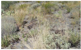
Shrubs/Mid and Shortgrass Community