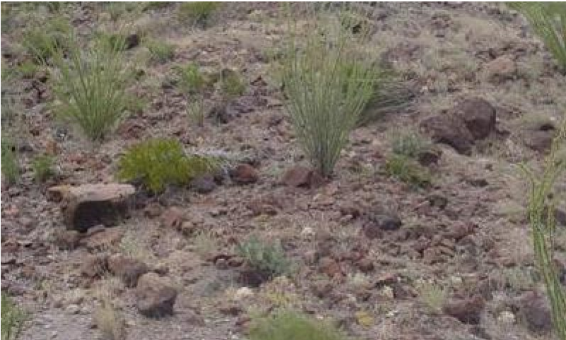
Figure 8. 1.2 Shrubs/Shortgrass Community

The Shrubs/Shortgrass Community (1.2) is the result of both overgrazing by livestock and drought. Overgrazing initially reduces the most palatable and deeper rooted midgrasses such as tanglehead, bush muhly, and Chino grama. Shallow rooted shortgrasses such as slim tridens, fluffgrass, and false grama remain stable and in some cases increase depending upon available resources. Competitive woody plants such as creosotebush begin to increase at the exclusion of other vegetation. Community appearance is slightly sparser. Exposed areas of surface gravels become evident due to displaced plants and decreased litter. Most of the climax perennial forbs persist. Prescribed grazing and some woody plant control can help prevent this community from crossing a compositional and functional threshold and into a naturally nonreversible and stable Shrubland State (3). A transition back towards HCPC, or a similar community, will require prescribed grazing and protection from any unnatural disturbance due to the inherently slow recovery rates within the Chihuahuan Desert.