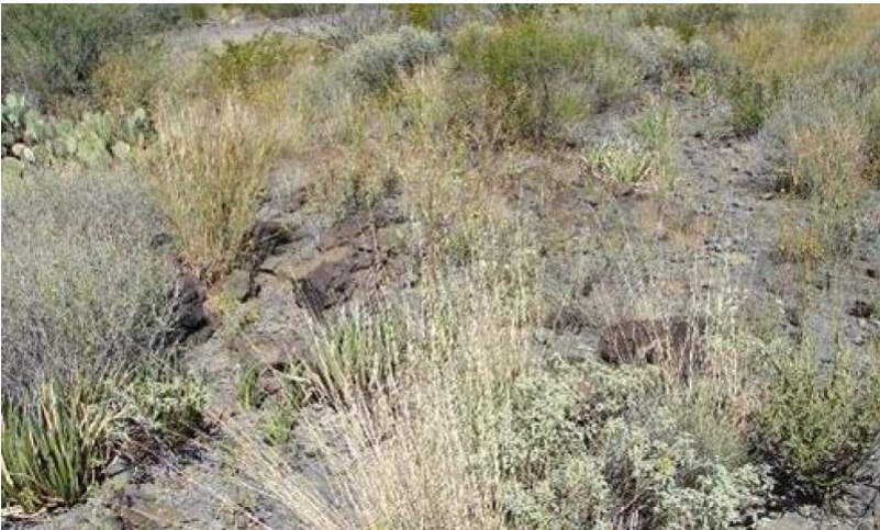
Figure 5. 1.1 Shrubs/Mid and Shortgrass Community