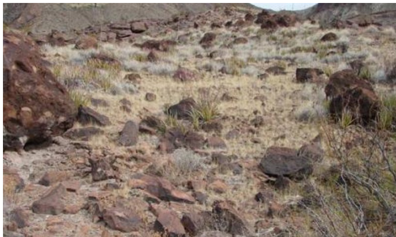
Figure 5. 1.1 Midgrasses/Mixed Shrubs Community

Grasses within this plant community total approximately 70% of the total species composition by weight, while woody plants and forbs account for 22% and 8% respectively. Tobosa and false grama are the dominant grasses while mesquite, lechuguilla, and leatherstem are dominant shrubs. The clayey soil allows for favorable water holding capacity following rain events. Surface fragments slow water runoff and provide protection for some plants from total herbivory. Ecological process (water cycle, nutrient cycle, and energy flow) are functioning with optimum efficiency due to the adequate amount of organic materials and surface fragments that cover the soil surface. Extended dry weather causes an overall decline in grass cover and production and can cause some retrogression. However, the HCPC evolved with plants that have drought tolerance. Long term retrogression is triggered primarily by abusive grazing which causes an immediate decrease and eventual eradication of the most palatable plants such as Arizona cottontop, sideoats grama, and menodora. Improper grazing management will transition the site to a shortgrass dominated plant community (2.1). Conservation practices such as prescribed grazing can help maintain ecological integrity within the reference plant community. Stocking rates need to be flexible and adjusted to carrying capacity because of sporadic rainfall.