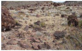
Midgrasses / Mixed Shrubs Community

Prescribed Grazing and favorable weather conditions can revert back to Midgrass/Mixed Shrubs Community.