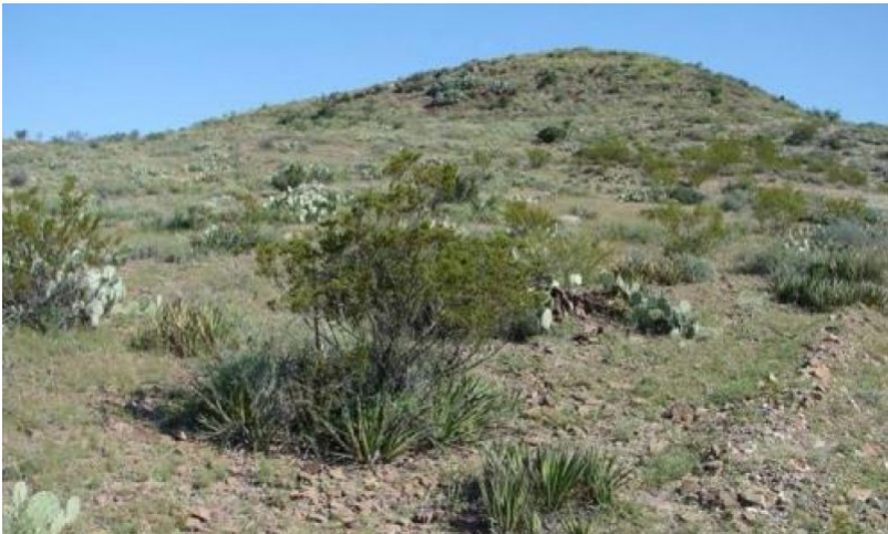
Figure 8. 1.2 Shortgrass Dominant Community

This plant community is the result of improper grazing management. Shortgrasses such as false grama and annual grasses dominate. Midgrasses are present, but mostly protected within woody plants. Lechuguilla and creosotebush begin slowly increasing. Hydrologic function is not optimized. With prescribed grazing the plant community can still return to a community similar to the reference community.