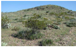
Shortgrass Dominant Community