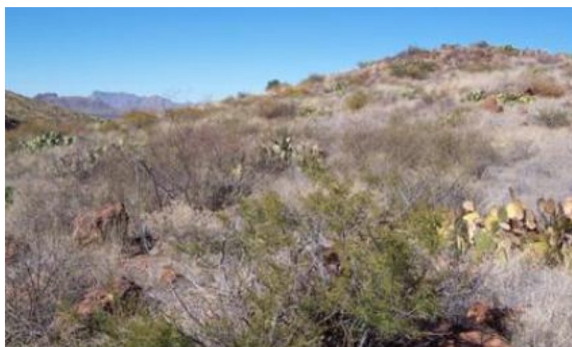
Figure 8. 2.1 Shrub/Shortgrass Complex Community