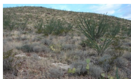
Patchy Black grama and Sideoats grama Community