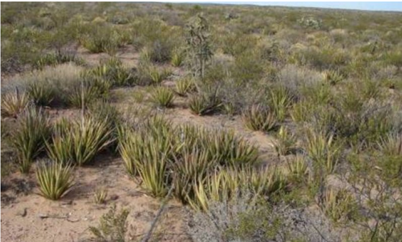
Figure 10. 2.1 Shrub Encroached Community (2)

This plant community 2.1 is the result of prolonged and extensive overutilization of plant resources by livestock. The plant community is mostly devoid of any grasses and is characterized “increaser” shrubs such as whitethorn acacia, lechuguilla, and/or creosotebush. A combination of prescribed grazing, brush management and favorable rainfall over several years can potentially facilitate grass recolonization. The rate of recovery will depend on the extent to which soil properties were altered during retrogression (Heitschmidt and Stuth 1991).