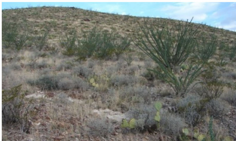
Figure 8. 1.2 Patchy Black Grama and Sideoats Grama Communit

The patchy black grama-sideoats grama plant community is a response to improper grazing management. Drought will only exacerbate the situation. Perennial grass cover is lower and patchy. Grasses such as threeawns, fluffgrass, slim tridens, and annual grasses have increased. Either separately or in combination, shrubs such as whitethorn acacia, lechuguilla, mariola, and creosotebush have also increased. Both annual and perennial forbs will also increase in relative composition. Continued intense grazing within this plant community and soil erosion can trigger the site to transition to the Shrub Encroached State 2. A combination of favorable rainfall and conservation practices such as prescribed grazing can help facilitate the recovery of grasses more palatable to livestock. A combination of community phases 1.1 and 1.2 occurring within a given area can provide the necessary habitat heterogeneity for both livestock and wildlife.