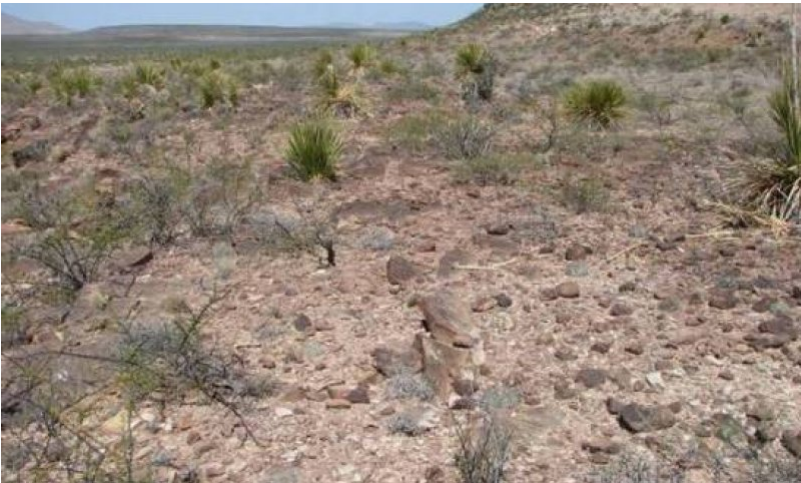
Figure 9. 2.1 Shrub Encroached Community