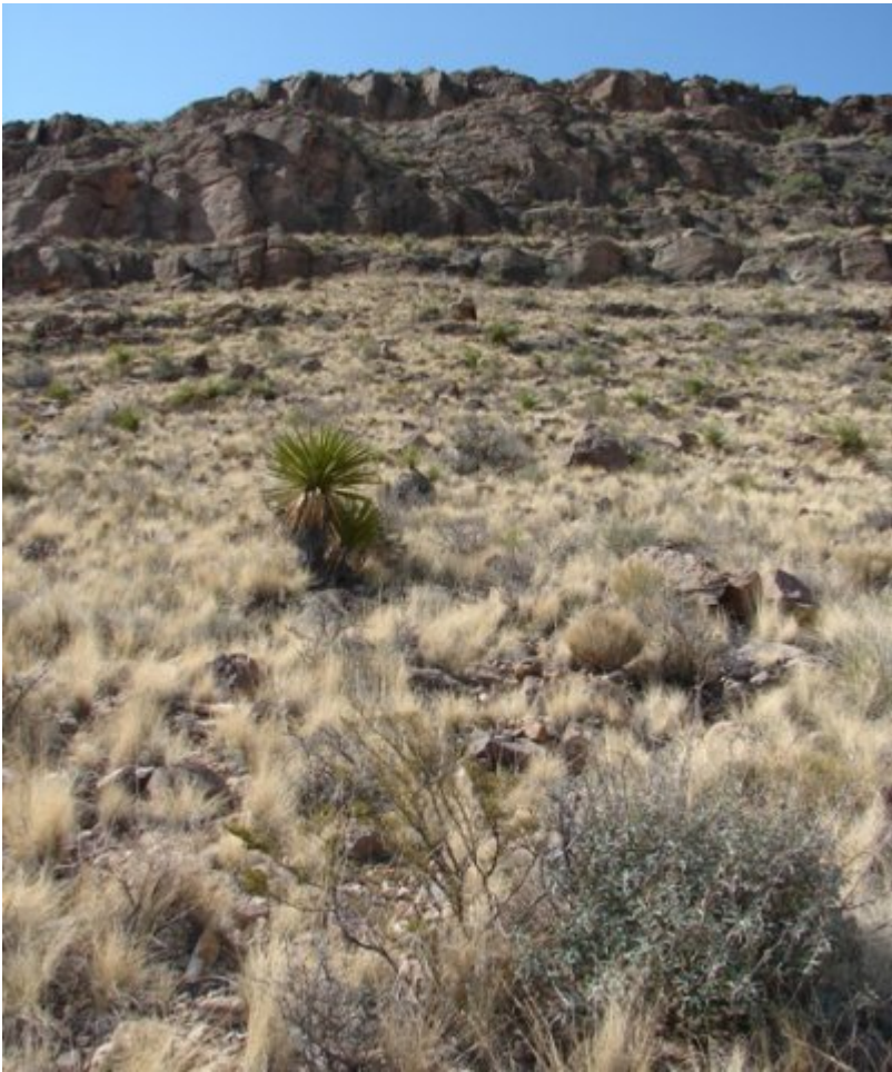
Figure 5. 1.1 Black grama/Sideoats grama Grassland Community

The black grama-sideoats grama grassland is the reference plant community for the site. Grasses account for approximately 80 percent of plant community by air dry weight, while shrubs and forbs account for 15 and 5 percent, respectively. The site is characterized by high perennial grass cover, minimal soil movement, and small, unconnected bare patches. Black grama and sideoats are the dominant grasses while other grasses such as Arizona cottontop, plains bristlegrass, sand dropseed, cane bluestem, and Hall’s panicum occur in association. Common shrubs include sotol, yucca, range ratany, feather dalea, skeletonleaf goldeneye, and pricklypear. Species composition and production will vary with aspect, elevation, slope gradient, and the natural range of soil characteristics. Under continuous heavy grazing by domestic livestock, palatable grasses such as black grama, plains bristlegrass, Arizona cottontop decrease in composition, while less palatable grasses such as fluffgrass, threeawns, and slim tridens begin to increase. Conservation practices such as prescribed grazing can help arrest and restore the trend back towards the reference plant community.