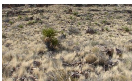
Black grama/Sideoats grama Grassland Community

With Prescribed Grazing and favorable rainfall, the Patchy Black grama and Sideoats grama Grassland Community converts to Black grama and Sideoats grama Grassland Community.