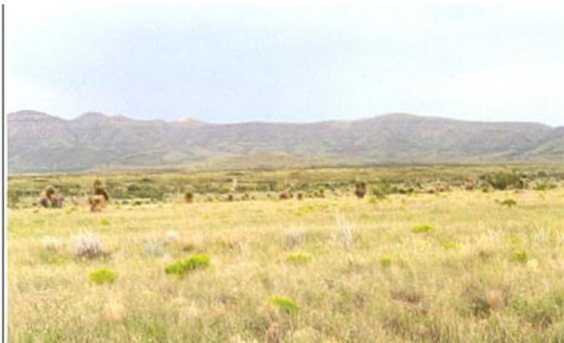
Figure 5. Grassland

Grasses dominate the historic plant community with shrubs evenly distributed throughout. Black grama and blue