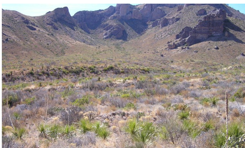
Figure 13. Shrub Dominant Community