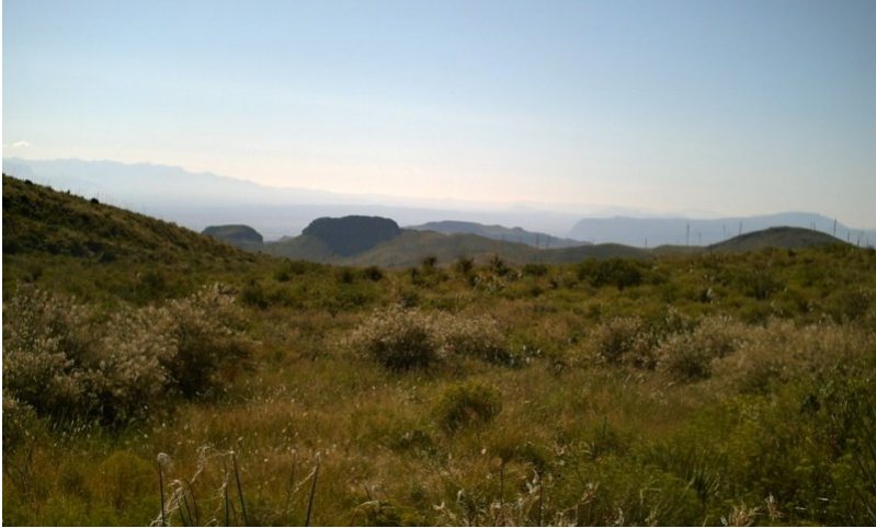
Figure 9. Short/Midgrass Dominant Community