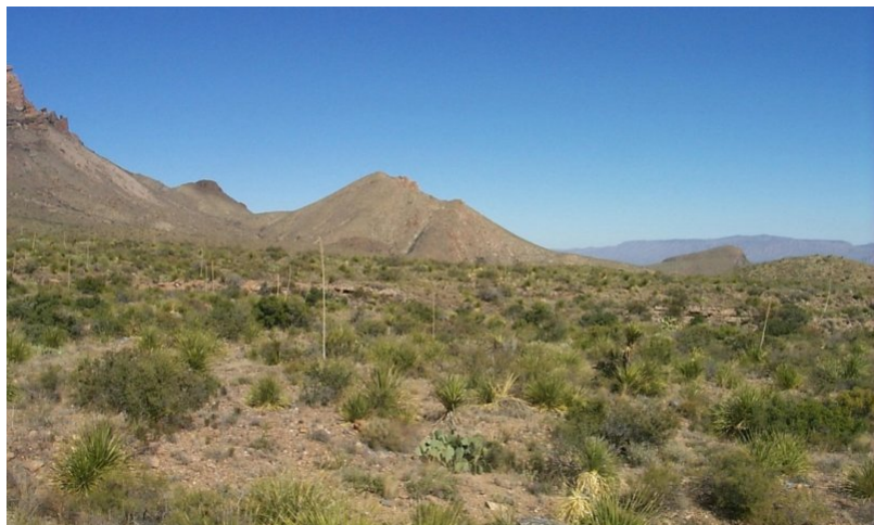
Figure 12. Shrub Dominant Community