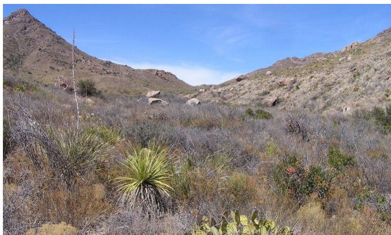
Figure 14. Shrub Dominant Community

This plant community is the result of extensive overutilization of plant resources by livestock and direct fire suppression. Improper grazing management reduces the amount of palatable midgrasses and fine fuels needed for natural fires to occur. This provides a competitive advantage to woody plants. The most prevalent woody plants that increase under these conditions are mariola, lechuguilla, broomweed, and several acacia species. Palatable grasses such as black grama, sideoats grama, and Arizona cottontop decrease. Fluffgrass and slim tridens increase following disturbance. Proper grazing management (adequate rest to allow recovery of some grasses) followed by prescribed fire and/or brush management will help transition the community back to a composition similar to the reference plant community. Brush management strategies may include grubbing and/or chemical herbicide application or most likely a combination of methods over time. Poor accessibility may limit brush management methods in some areas.