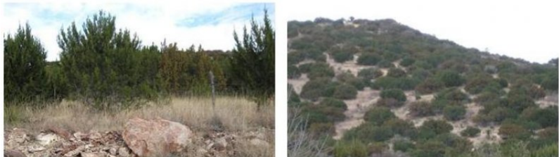
Figure 8. 2.1 Shrubland Community

These plant communities are the result of livestock overgrazing and direct fire suppression. Overgrazing reduces the amount of palatable midgrasses and fine fuels needed for natural fires to occur. This provides a competitive advantage to woody plants. The most prevalent woody plant to increase is redberry and/or rosefruited juniper. Increases in shrubs and forbs such as catclaw mimosa, cutleaf goldenweed and broomweed are also observed. Proper grazing management (adequate rest to allow recovery of some grasses) followed by prescribed fire and/or brush management will help transition the community back to composition similar to the reference. Brush management strategies may include grubbing and/or chemical herbicide application. Poor accessibility may limit management methods on steep slopes.