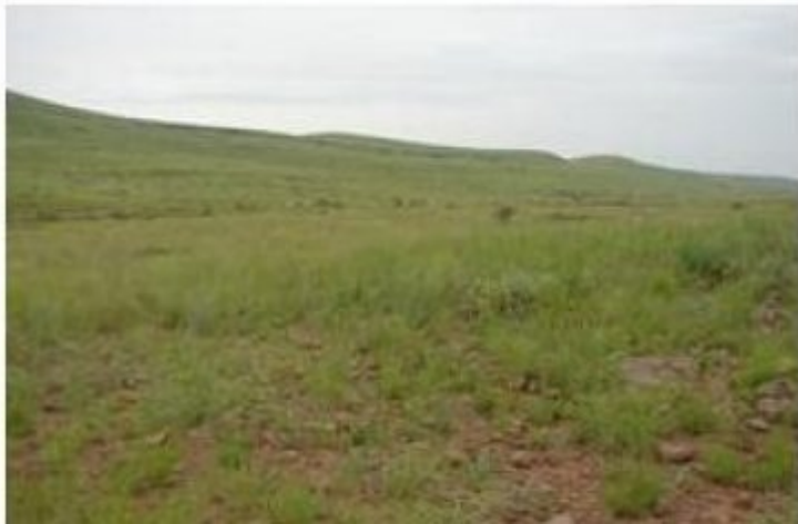
Figure 5. 1.1 Short/Midgrasses/Shrubs Community

The distribution of vegetation within the site is highly dependent on local environment. Elevation, soil moisture, aspect, slope, latitude, variability of the soils, and amount of rock outcrop are the major factors driving species composition and distribution. The Historic Climax Plant Community (HCPC) for the site is composed primarily of a diversity of short and midgrasses, numerous perennial forbs, and a few trees and shrubs and is the reference plant community. Areas lacking significant rock outcrops are predominately a grassland plant community with very few woody plants (mostly isolated shrubs). Areas with significant rock outcrops generally support more woody plants such as oaks, junipers, and a higher diversity of shrubs and forbs. Cooler, north facing slopes will generally support more oaks and junipers than south facing slopes. Retrogression resulting from livestock overgrazing will result in a reduction of palatable grasses and ultimately litter accumulation. This will reduce the likelihood of natural fires because of the reduction of fine fuels. Direct fire suppression will also continue to allow woody plants such as catclaw mimosa and juniper to increase. The plant communities will eventually transition to a juniper woodland or a catclaw shrubland.