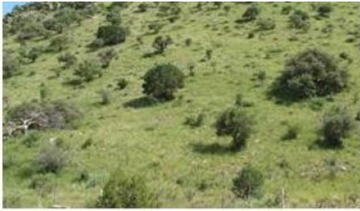
Short/Midgrasses/Shrubs Community – North Facing Slopes