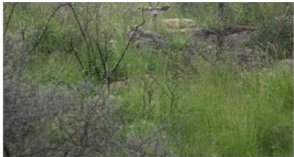
2.1 Shrubland Community – Catclaw mimosa Dominant