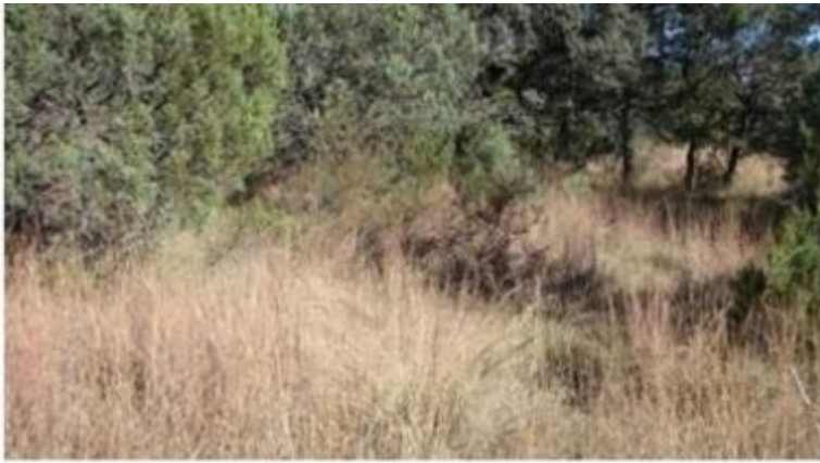
Pinyon-Juniper Woodland – North Facing Slopes