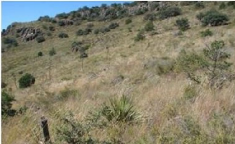
Figure 5. 1.1 Pinyon-Juniper Woodland (North Slopes) or Oak