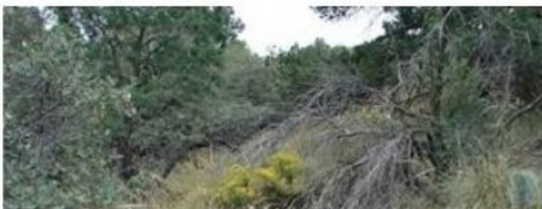
Figure 8. 2.1 Pinyon-Juniper Forest (North Slopes) and Oak W

These plant communities are the result of livestock overgrazing and direct fire suppression. Overgrazing reduces the amount of fine fuels needed for natural fires to occur. This provides a competitive advantage to woody plants. Climate limitations will most likely prevent the oak woodland on south facing slopes to transition to a closed forest. Increases in shrubs such as catclaw mimosa are observed. On cooler and wetter north facing slopes, a closed