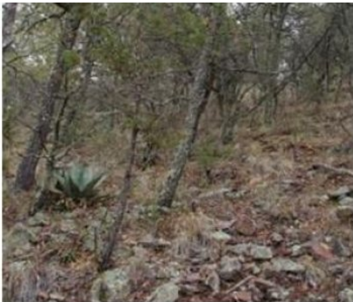
2.1 Pinyon-Juniper Forest – North Facing Slopes