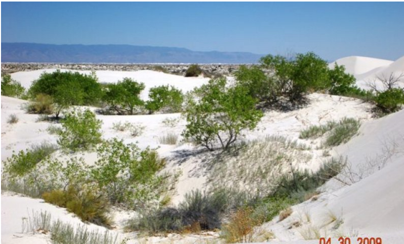
Figure 6. Cottonwood/Mixed shrubs community 2.1

This state is characterized by the dominance of cottonwoods.