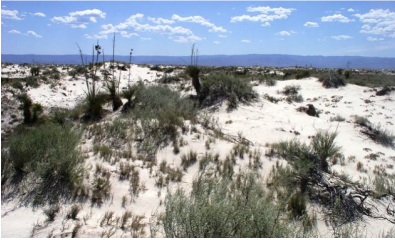
Figure 4. Shrub/mixed grass community 1.1

This is the more common community type within the vegetated dune system. Shrubs are dominant and are scattered amid the dunes usually occupying the summits of the dune. Frosted mint is typically the dominant species. Other shrubs can include skunkbush sumac, soap tree yucca, ephedra, fourwing saltbush, broom dalea, and rubber rabbitbrush. Grasses are usually the subordinate component scattered between shrubs. Sandhill muhly or gyp grama is the dominant grass species. Sandhill muhly seems to be more prevalent on the more active dunes and on dunes with coarser textured surface sands. Gypsum grama usually dominates on smaller dunes and is most prolific near the interface between the dune and the interdune. Other grasses can include Indian ricegrass, New Mexico bluestem, and mesa dropseed. In some areas rubber rabbitbrush may be the dominant shrub with sparse amounts of alkali sacaton present.