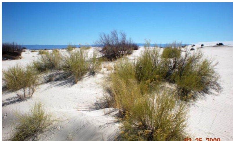
Figure 7. Shrubs/Grass/Saltcedar community 3.1

This community is characterized by the presence of saltcedar amid mixed shrubs and scattered grasses. Shrubs typically include rabbitbrush, frosted mint, and skunkbush sumac. Grass species for this community typically include alkali sacaton, sandhill muhly, and Indian ricegrass.