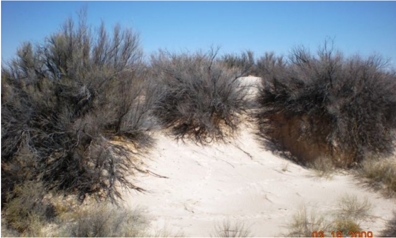
Figure 8. Saltcedar community 4.1

High seed production and the ability of saltcedar to exploit suitable habitat makes the site susceptible to the establishment of dense localized stands among the dunes.