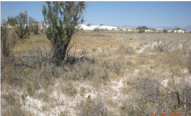
Figure 12. Saltgrass/saltcedar

Inland saltgrass is dominant with varying amounts of scattered saltcedar present.