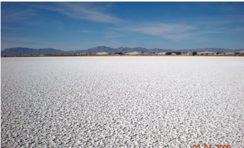
Figure 14. Playa Center