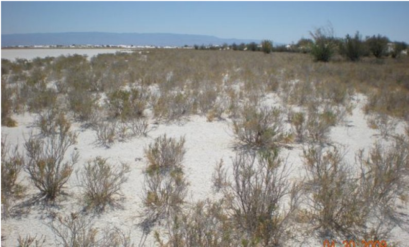
Figure 9. Iodinebush