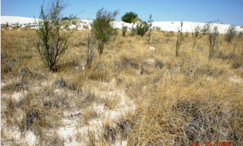
Figure 11. Saltcedar Invaded

Alkali sacaton is the dominant species, with scattered individual saltcedar present in varying amounts. This community occurs on the higher portion of the playa edge.