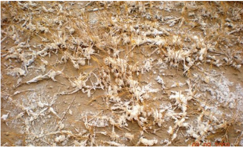
Figure 8. Saltgrass close-up photo

Inland saltgrass is the dominant species. Other species include Trans-Pecos sea lavender, alkali sacaton, and scattered iodinebush. Saltgrass has a high tolerance to both salinity and anerobic conditions.