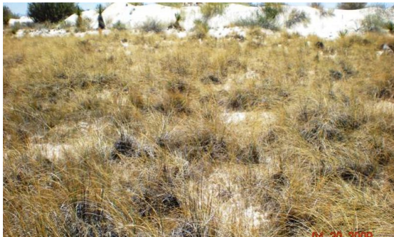
Figure 5. Alkali sacaton

This community occupies the upper-most zone of the playa edge. Alkali sacaton is dominant and occurs in large tussocks. Other species typically include inland saltgrass and Trans-Pecos sea lavender. Occasionally, frankennia and Trans-Pecos false clappdaisy may be present. This community can be highly productive especially on the leeward side of the playa. Communities on the windward side are much less productive.