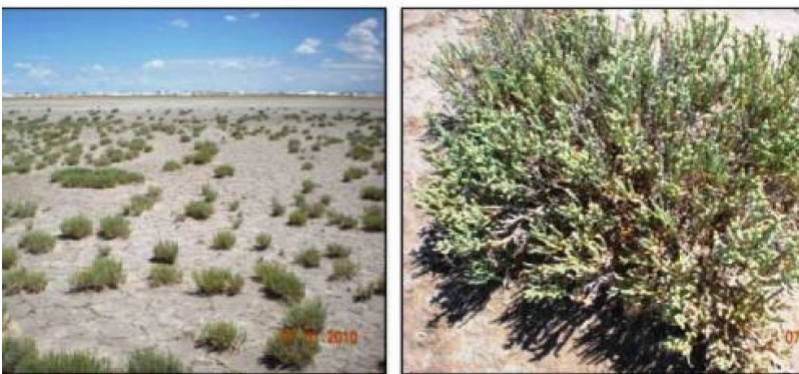
Figure 10. Utah swampfire

This is the first community moving up from the barren playa center. Iodinebush is dominant. Other species may include Trans-Pecos sea lavender, and alkali seepweed. Iodinebush seems to have very high tolerance to salinity and extended periods of inundation (anaerobic conditions). In some localized areas Utah swampfire ( Sarcocornia utahensis ) may be dominant with Iodinebush occurring as sub-dominant.