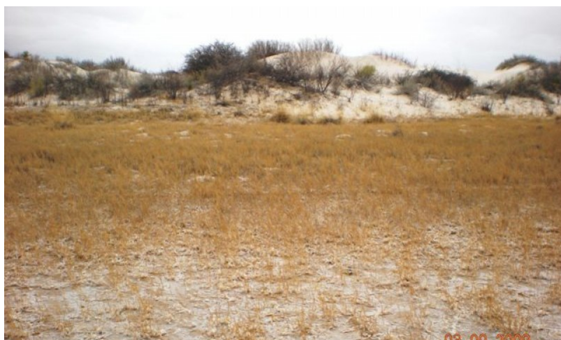
Figure 7. Inland saltgrass