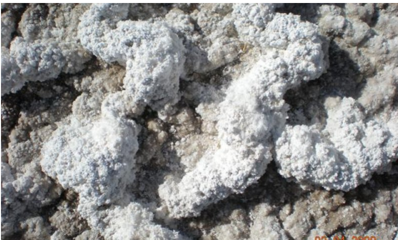
Figure 15. Surface close-up photo