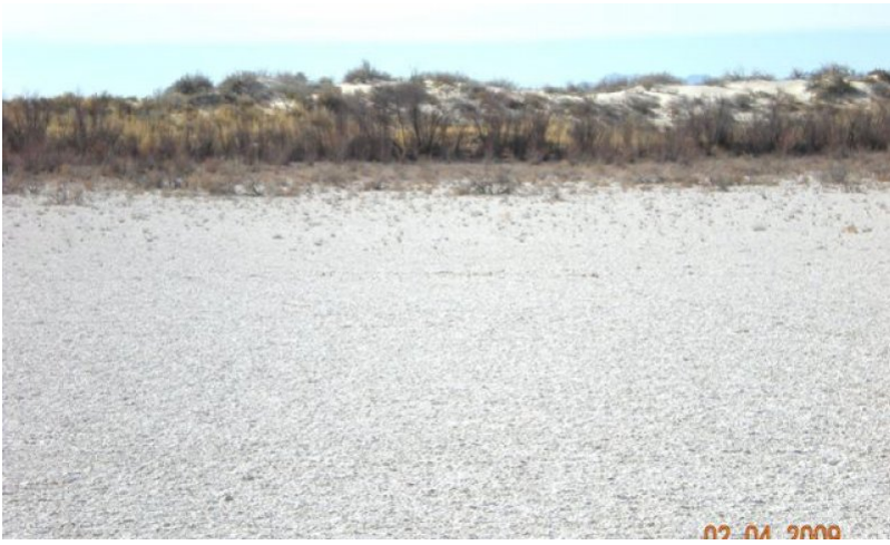
Figure 13. Saltcedar band

Saltcedar is the dominant species. Inland saltgrass may still be present, but as a minor component usually occupying small depressions or scattered outside clusters of saltcedar. Other species that may be present include alkali seepweed, iodinebush, alkali sacaton and Trans-Pecos sea lavender.