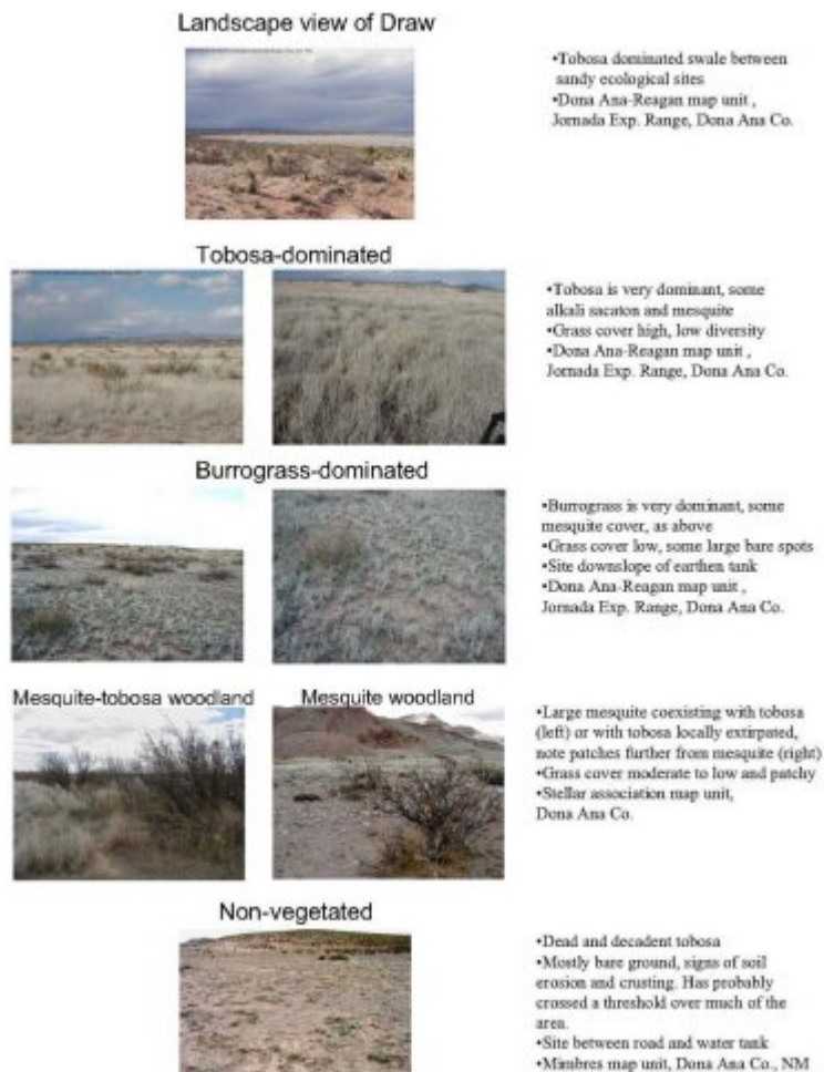
Figure 4. SD-2; Draw