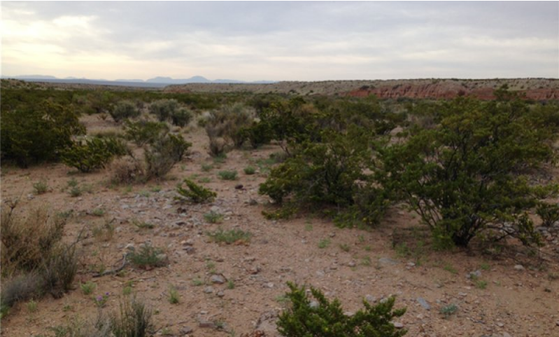
Figure 9. Creosote/Galleta