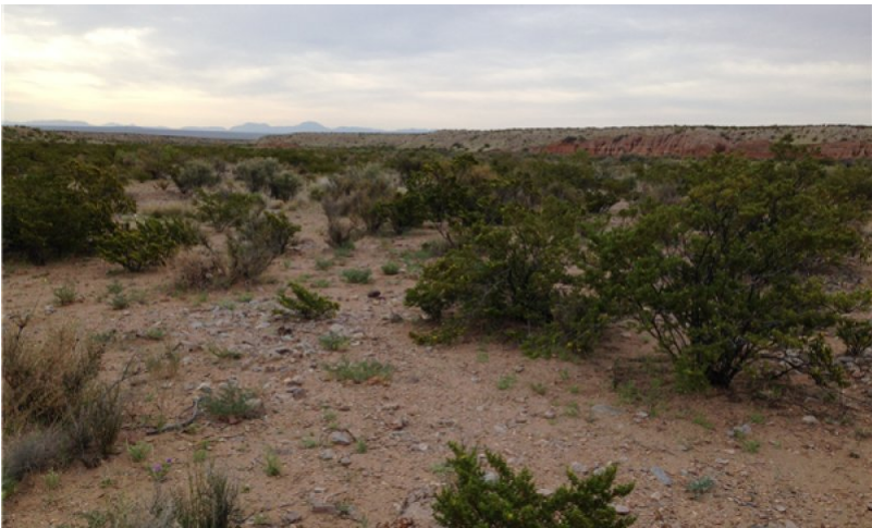
Figure 9. Creosote/Galleta