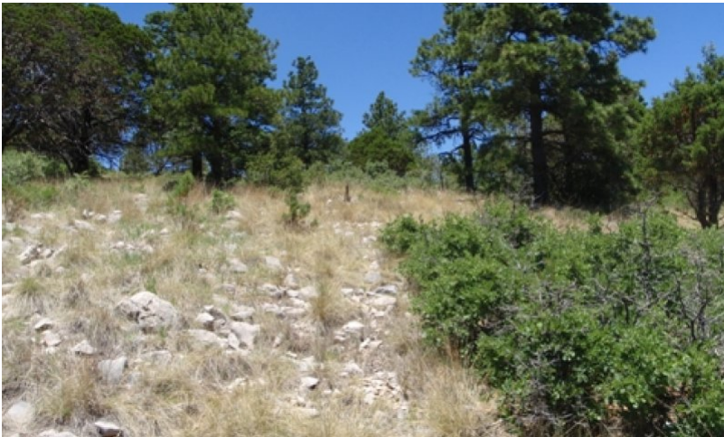
Figure 5. 1.1 Pine-Pinyon-Juniper/Oak/Bluestem/Muh