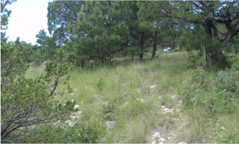
Figure 4. 1.1 Pine-Pinyon-Juniper/Oak/Bluestem-Muhly (3)