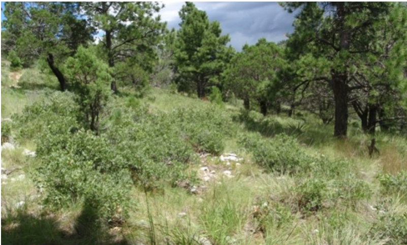
Figure 6. 1.1 Pine-Pinyon-Juniper/Oak/Bluestem-Muhly (2)

This community is the potential or reference plant community. It is characterized by a dominance of ponderosa pine. Associated trees include pinyon pine, alligator juniper, oneseed juniper, and Gambel’s oak. Common shrubs include wavyleaf oak, mountain mahogany, cliff fendlerbush, banana yucca, and New Mexico agave. Big bluestem, little bluestem, yellow indiagrass, bull muhly, pine muhly, mountain muhly, pinyon ricegrass, squirreltail, and needlegrasses are common warm and cool season grasses. The south facing aspect prevents closed canopy forest from occurring. Abundant fuels are available to carry frequent lightning caused fires. Ecological processes are optimized in this phase.