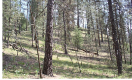
Understory Re-initiation Phase

Lack of reoccurring fire causing increase in pine establishment.