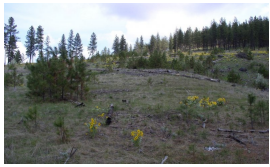
Stand Initiation Phase