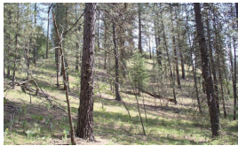
Understory Re-initiation Phase

Time. Lack of fire allowing pine regeneration to survive in a patchy mosaic underneath overstory pine. Some woodland shrubs like snowberry, serviceberry, chokecherry and rose species may establish. Occasionally a Douglas-fir may establish in this condition. A mixed severity fire will thin out the understory pine stand and kill the shrubs and Douglas-fir.