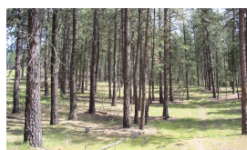
Alternative State 2 – Fire Exclusion – Pine Woodland