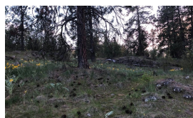
Reference State - Open Ponderosa pine/Bunchgrass