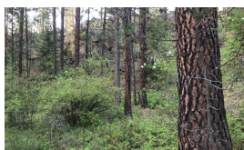
Mature Ponderosa pine Woodland

Intense site preparation to kill cool season introduced grasses. Native shrub and grass seeding needed if native vegetation is sparse.