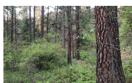
Mature Ponderosa pine Woodland