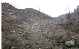
Reference Plant Community – Open Stand