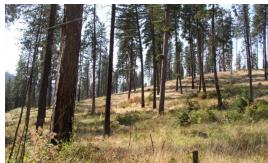
Reference Plant Community – Open Stand

Fire at 10 – 15 year intervals keep stand in open condition.